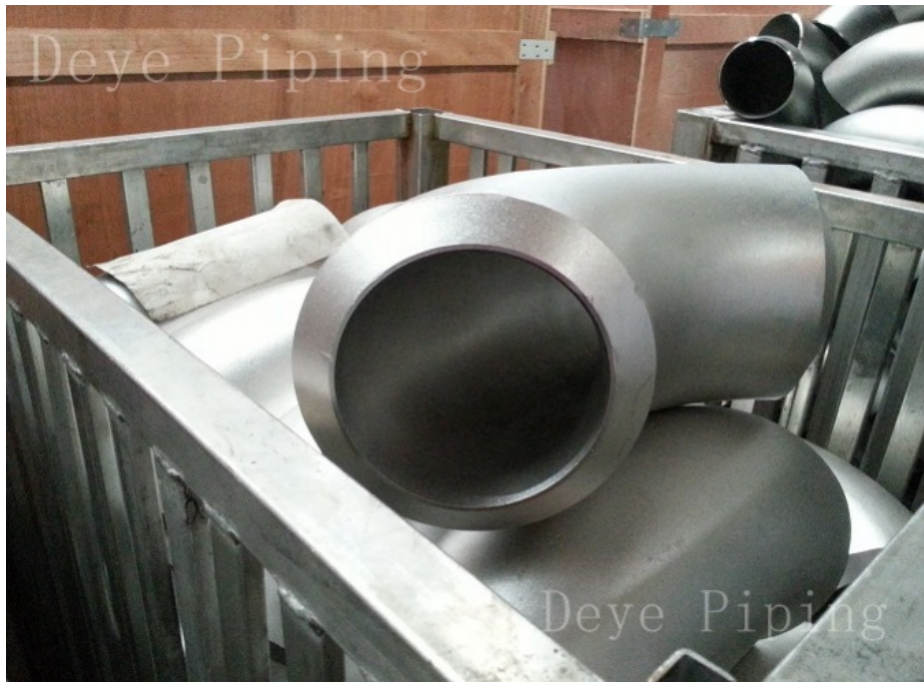
8. After Polished