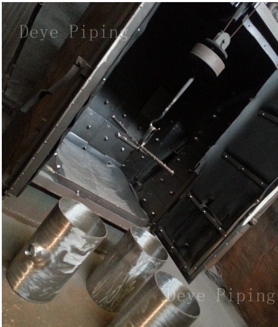
7. Surface checking