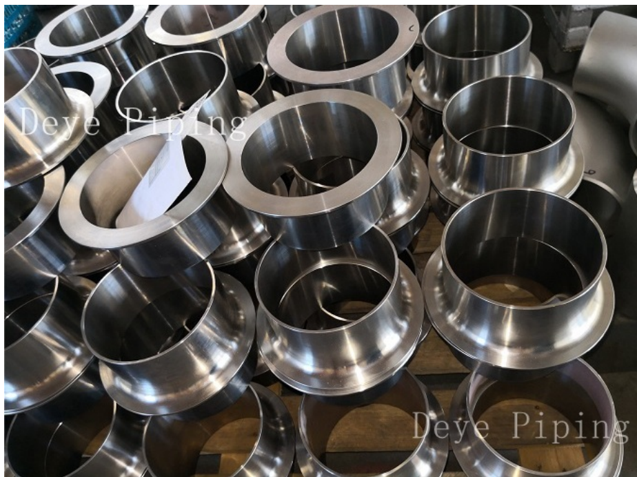
9. stainless steel Pipefittings Material In Stock